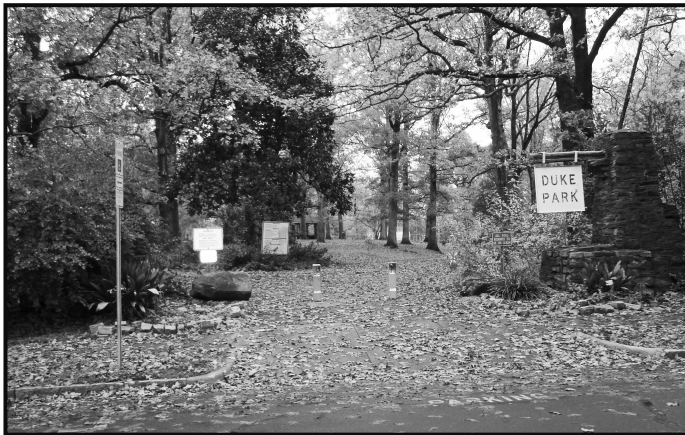
Before DPNG beautification (above), and after (below)