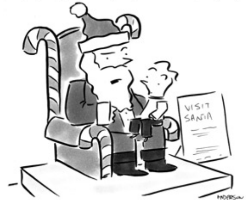
"Your tweets tell a different story..."